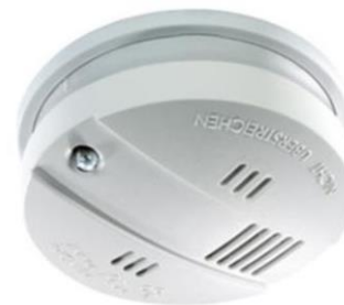
pic. 4.4: Domestic smoke alarm

The domestic smoke alarms are battery-operated and fitted with a blinking light. If the battery runs low the device will give off a signal. In that case please inform the residence manager to replace the battery.