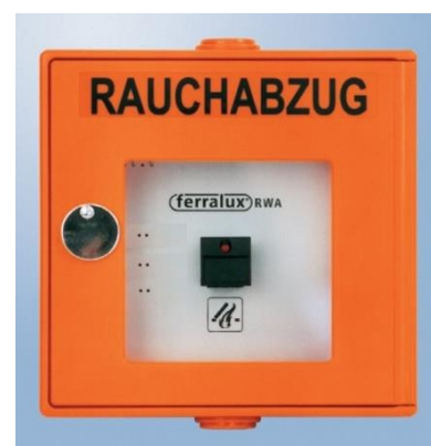
pic. 4.3: smoke vent button

Pushing the smoke vent button does not cause an automatic alarm message to the fire brigade like the fire alarm button. Therefore, in case of emergency, additionally push the fire alarm button and alert the fire brigade via telephone.