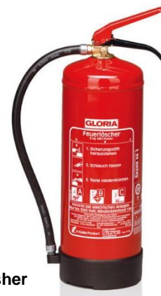
pic. 4.1: fire extinguisher