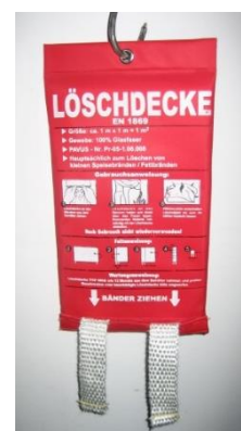
pic. 4.2: fire blanket