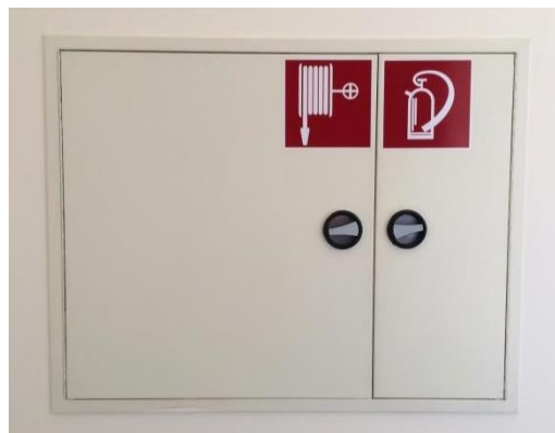
pic. 4.4.1: wall hydrant cabinet (here together with extinguisher)

Wall hydrants are water supply points installed in wall cabinets for the purpose of fire fighting. Familiarize yourself with their proper handling and location. They are not only provided for the fire brigade, but similar to a fire extinguisher accessible to anyone to fight a fire in the incipient stage.