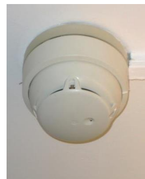
pic. 4.2: smoke detector

⇒ A false alarm must be paid for to Akademikerhilfe by the perpetrator; the amount to be paid will be decided by the fire brigade.