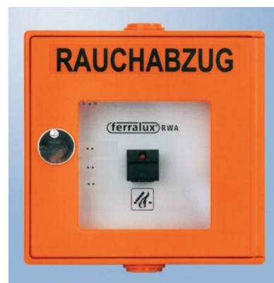
pic. 4.5: smoke vent button

Pushing the smoke vent button does not cause an automatic alarm message to the fire brigade like the fire alarm button. Therefore, in case of emergency, additionally push the fire alarm button and alert the fire brigade via telephone.