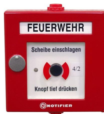
Pic. 4.1: fire alarm button

These buttons trigger the fire alarm. Pushing the button not only raises an alarm (siren) in the house, but also alerts the fire brigade directly and immediately. Every resident is required to memorize the location of the nearest fire alarm button and to activate it when a fire is detected.