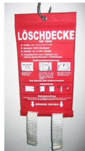
pic. 4.6: fire blanket