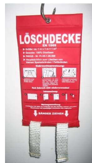
pic. 4.3: fire blanket