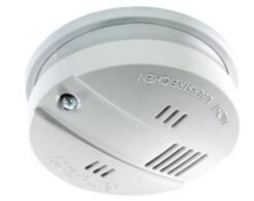
pic. 4.4: Domestic smoke alarm

Domestic smoke alarms give off a signal as soon as a certain concentration of smoke or vapour or a certain temperature are exceeded (e.g. cigarette smoke, water vapour etc.). A false alarm can be stopped by removing the source of the alarm and by airing the room. Complying with the general fire protection measures and