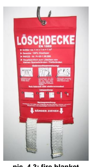
pic. 4.3: fire blanket