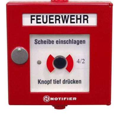
Pic. 4.1: fire alarm button

not only raises an alarm (siren) in the house, but also alerts the fire brigade directly and immediately. Every resident is required to memorize the location of the nearest fire alarm button and to activate it when a fire is detected.