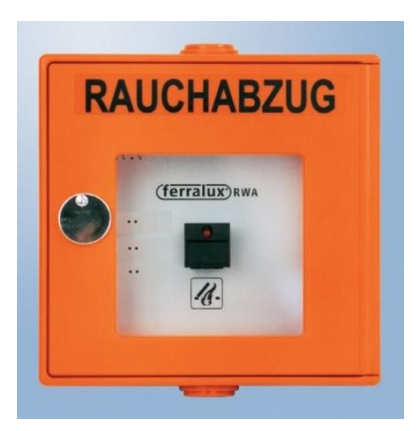
pic. 4.5: smoke vent button

Pushing the smoke vent button does not cause an automatic alarm message to the fire brigade like the fire alarm button. Therefore, in case of emergency, additionally push the fire alarm button and alert the fire brigade via telephone.