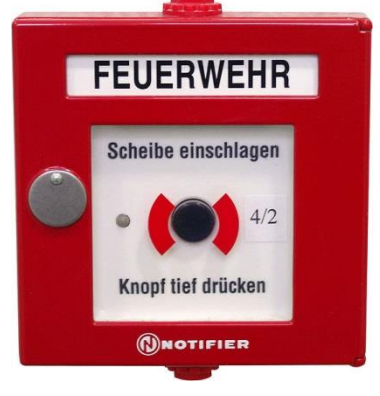
Pic. 4.1: fire alarm button

not only raises an alarm (siren) in the house, but also alerts the fire brigade directly and immediately. Every resident is required to memorize the location of the nearest fire alarm button and to activate it when a fire is detected.