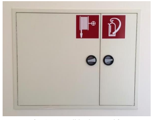
pic. 4.4.1: wall hydrant cabinet (here together with extinguisher)

only provided for the fire brigade, but similar to a fire extinguisher accessible to anyone to fight a fire in the incipient stage.