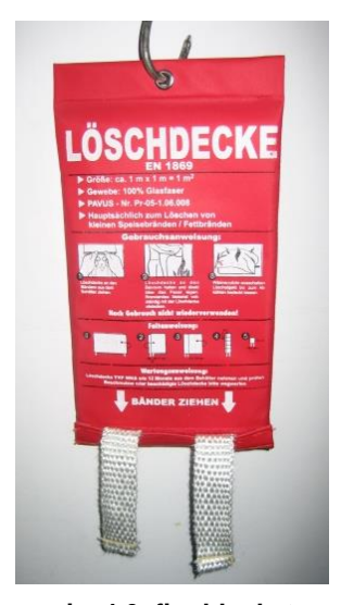
pic. 4.6: fire blanket