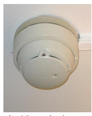
pic. 4.2: smoke detector

⇒ A false alarm must be paid for to Akademikerhilfe by the perpetrator; the amount to be paid will be decided by the fire brigade.