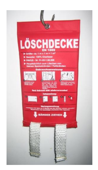
pic. 4.6: fire blanket