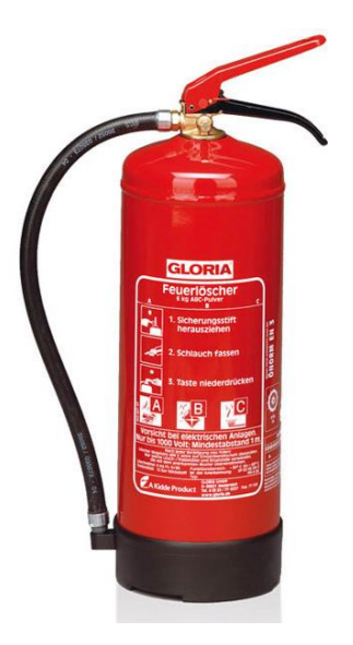
pic. 4.3: fire extinguisher