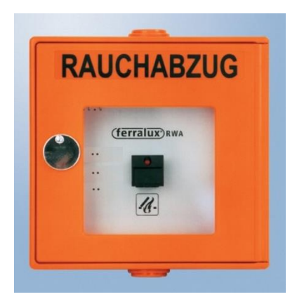
pic. 4.5: smoke vent button

Pushing the smoke vent button does not cause an automatic alarm message to the fire brigade like the fire alarm button. Therefore, in case of emergency, additionally push the fire alarm button and alert the fire brigade via telephone.