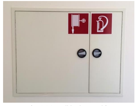
pic. 4.4.1: wall hydrant cabinet (here together with extinguisher)

only provided for the fire brigade, but similar to a fire extinguisher accessible to anyone to fight a fire in the incipient stage.