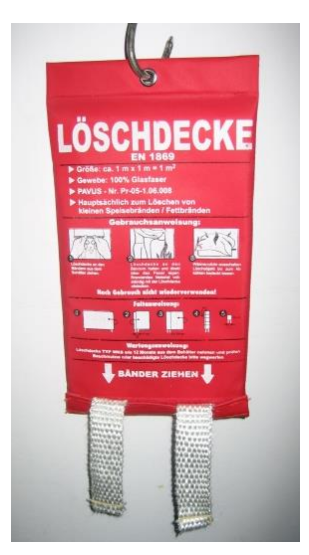
pic. 4.5: fire blanket