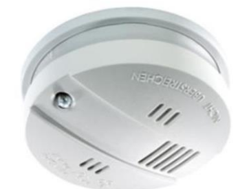
pic. 4.6: Domestic smoke alarm

Domestic smoke alarms give off a signal as soon as a certain concentration of smoke or vapour or a certain temperature are exceeded (e.g. cigarette smoke, water vapour etc.). A false alarm can be stopped by removing the source of the alarm and by airing the room. Complying with the general fire protection measures and regulations will help to avoid false alarms. No objects must be placed within a distance of at least 50 cm around the warning device.