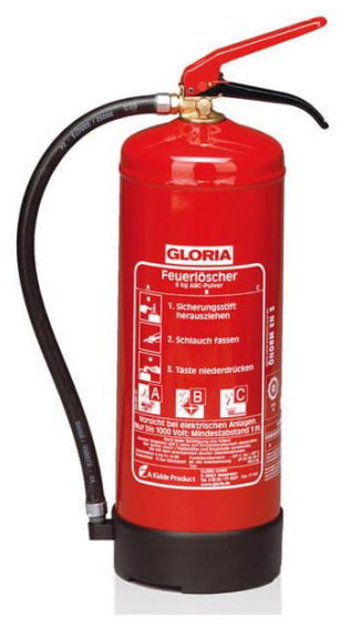
pic. 4.3: fire extinguisher