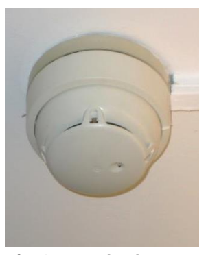
pic. 4.2: smoke detector

⇒ A false alarm must be paid for to Akademikerhilfe by the perpetrator; the amount to be paid will be decided by the fire brigade.