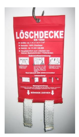
pic. 4.5: fire blanket