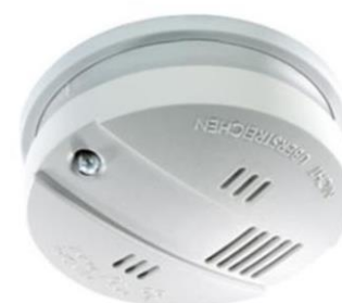
pic. 4.5: Domestic smoke alarm

Domestic smoke alarms give off a signal as soon as a certain concentration of smoke or vapour or a certain temperature are exceeded (e.g. cigarette smoke, water vapour etc.). A false alarm can be stopped by removing the source of the alarm and by airing the room. Complying with the general fire protection measures and regulations will help to avoid false alarms. No objects must be placed within a distance of at least 50 cm around the warning device.