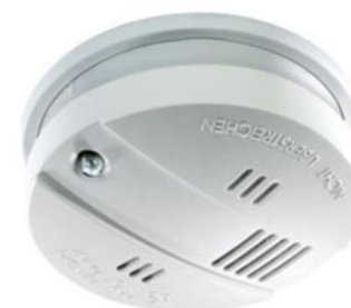
pic. 4.7: Domestic smoke alarm

Domestic smoke alarms give off a signal as soon as a certain concentration of smoke, vapour, dust or a certain temperature are exceeded (e.g. cigarette smoke, water vapour etc.). A false alarm can be stopped by removing the source of the alarm and by airing the room. Complying with the general fire protection measures and regulations will help to avoid false alarms. No objects must be placed within a distance of at least 50 cm around the warning device.