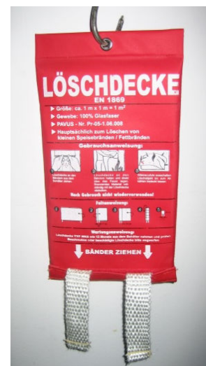
pic. 4.6: fire blanket