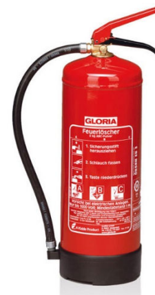
pic. 4.3: fire extinguisher