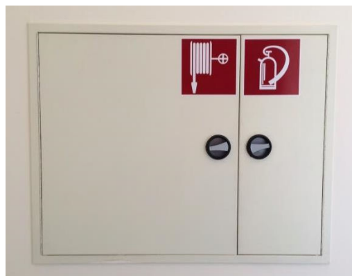
pic. 4.4.1: wall hydrant cabinet (here together with extinguisher)

Wall hydrants are water supply points installed in wall cabinets for the purpose of fire fighting. Familiarize yourself with their proper handling and location. They are not only provided for the fire brigade, but similar to a fire extinguisher accessible to anyone to fight a fire in the incipient stage.