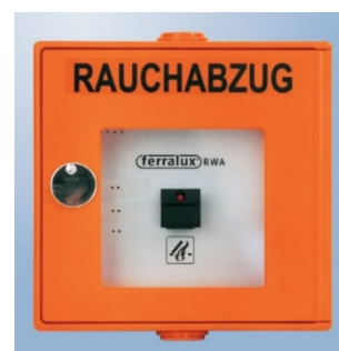
pic. 4.5: smoke vent button

Pushing the smoke vent button does not cause an automatic alarm message to the fire brigade like the fire alarm button. Therefore, in case of emergency, additionally push the fire alarm button and alert the fire brigade via telephone.