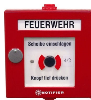
Pic. 4.1: fire alarm button