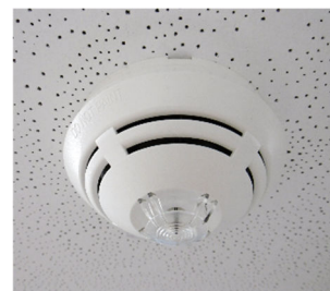
pic. 4.2: smoke detector

To avoid false alarms of the fire alarm system, the general fire prevention measures must be observed. A radius of at least 50 cm around the smoke detectors must always be kept free from any objects.